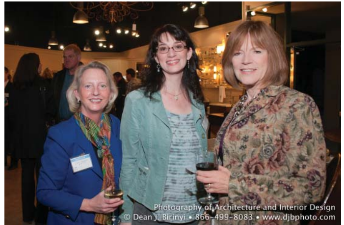
Photography of Architecture and Interior Design