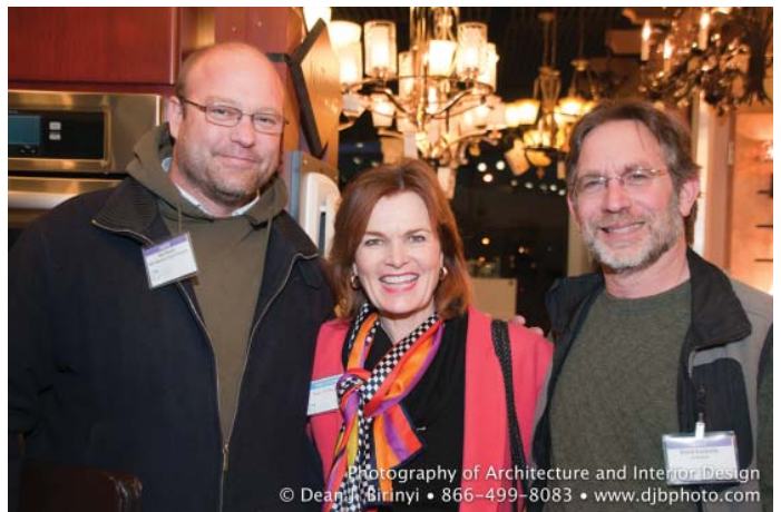
Photography of Architecture and Interior Design