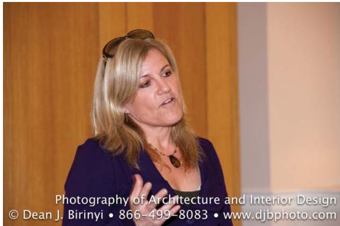
Photography of Architecture and Interior Design