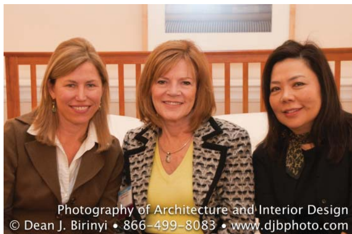
Photography of Architecture and Interior Design