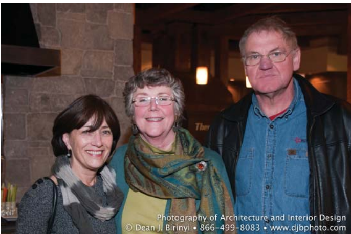
Photography of Architecture and Interior Design