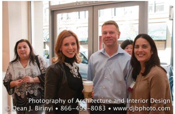
Photography of Architecture and Interior Design